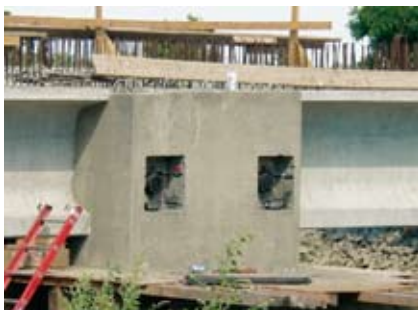
The integral post-tensioned bent caps transferred longitudinal moment between the columns and the superstructure.

The middle span drop-in segments span between the cantilever ends of the end