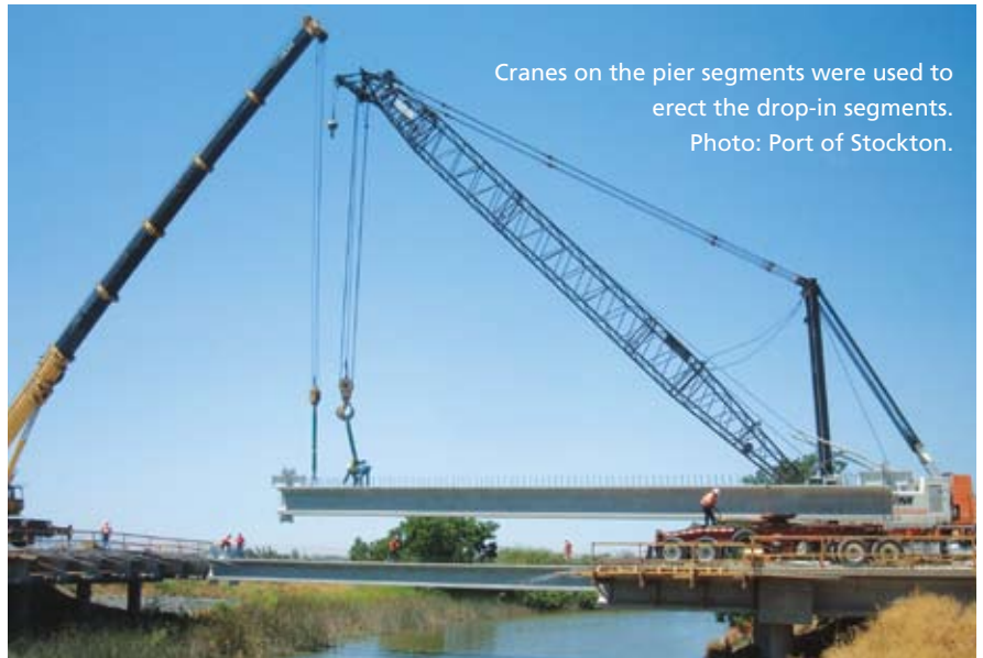
Cranes on the pier segments were used to erect the drop-in segments.

span/pier segments. They also consist of a constant depth bulb-tee shape for the positive moment region. They are pretensioned for lifting and handling stresses and contain ducts for the two-stage post-tensioning of the continuous girder and composite sections.