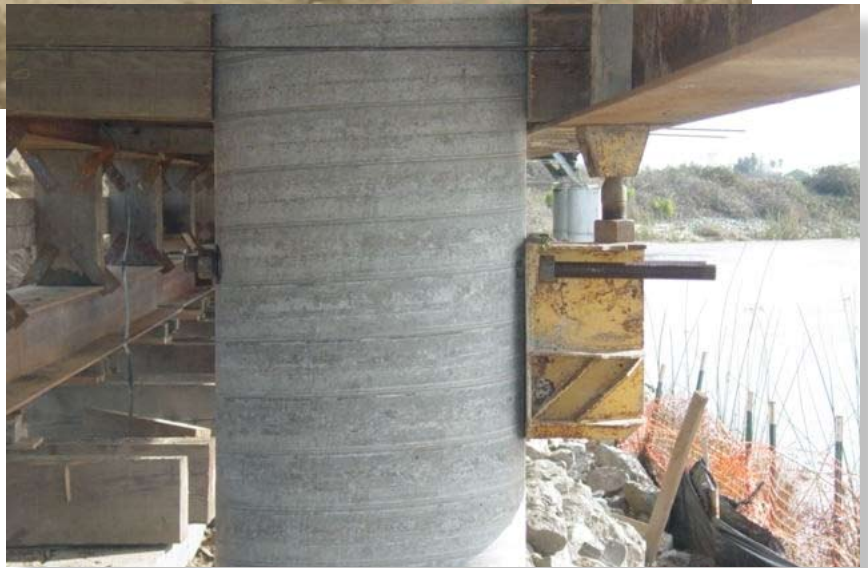
Temporary supports were provided at the bent caps to support the pier segment.