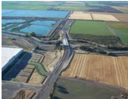
Daggett Road links State Highway 4 with Rough and Ready Island.