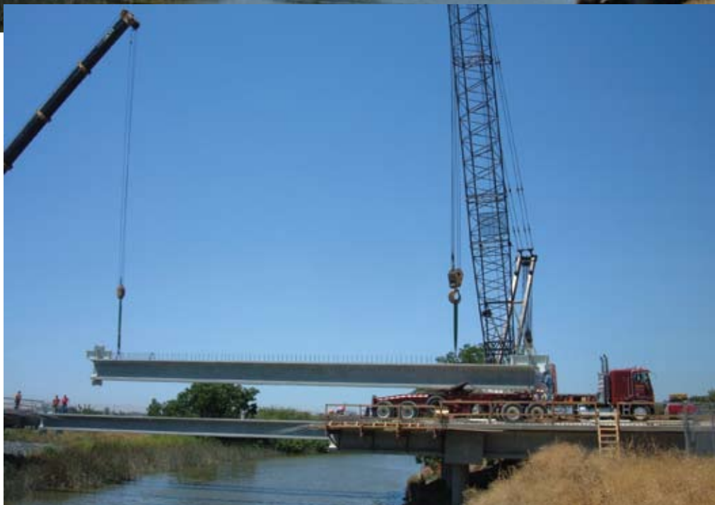
Cranes on the pier segments were used to erect the drop-in segments.