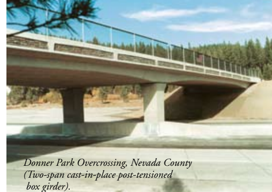
Donner Park Overcrossing, Nevada County (Two-span cast-in-place post-tensioned box girder).

Isolation from extreme event forces such as earthquakes is a proven means of cost-efficient design. This strategy has been employed in civil infrastructure design worldwide, from Japan to Italy and California. Rather than relying solely on ductile behavior, the premise is to limit the forces transmitted into the structure by isolating portions from ground motions, or reducing the input magnitude. Numerous devices exist today to accomplish this goal, from large self-centering bearings to viscous dampers, hysteretic damping mechanisms, and lock-up devices. These are particularly useful when considering retrofitting existing structures not previously detailed to respond in a ductile fashion to large displacement demands. As primary reinforcement confinement is crucial to ductile behavior, it may be difficult to incorporate into existing structures, particularly on large-scale structures, and thus isolation strategies become more enticing for retrofits. Most of the major long-span toll structures have some type of seismic response