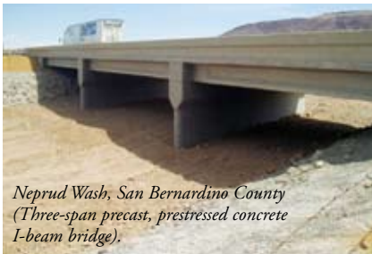
Neprud Wash, San Bernardino County (Three-span precast, prestressed concrete I-beam bridge).

equity between adjacent bents in a frame and/or adjacent columns in a bent, and tuning the fundamental periods of vibration of adjacent frames. The above is analogous to an appealing aesthetic design wherein proportioning yields enhanced visual flow; seismic forces are better resisted through balanced geometries.