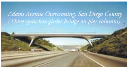
Adams Avenue Overcrossing, San Diego County (Three-span box girder bridge on pier columns).

The broad spectrum of landscape, from majestic mountain ranges to broad cultivated valleys and legendary coastline, defines the uniqueness of California. The state is situated at the junction of the Pacific and North American plates—two active tectonic crustal plates forming part of the “Rim of Fire.” This is one of the most active volcanic and seismic regions in the world today. The constant shifting of the plates forms some of the most tantalizing landscape in the world, but also presents tremendous engineering challenges in one of the most heavily populated states. Geography, climate, and history have come together in California to produce dense population centers, with a high concentration of bridges in regions of high seismicity.