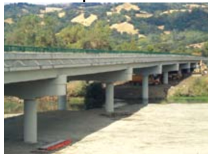
Russian River Bridge, Sonoma County (Precast, prestressed and post-tensioned double-tee superstructure used as an emergency replacement).