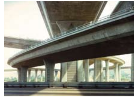
Mission Valley Interchange, San Diego County (Multi-span box girders on single column bents).

The broad spectrum of landscape, from majestic mountain ranges to broad cultivated valleys and legendary coastline, defines the uniqueness of California. The state is situated at the junction of the Pacific and North American plates—two active tectonic crustal plates forming part of the “Rim of Fire.” This is one of the most active volcanic and seismic regions in the world today. The constant shifting of the plates forms some of the most tantalizing landscape in the world, but also presents tremendous engineering challenges in one of the most heavily populated states. Geography, climate, and history have come together in California to produce dense population centers, with a high concentration of bridges in regions of high seismicity.