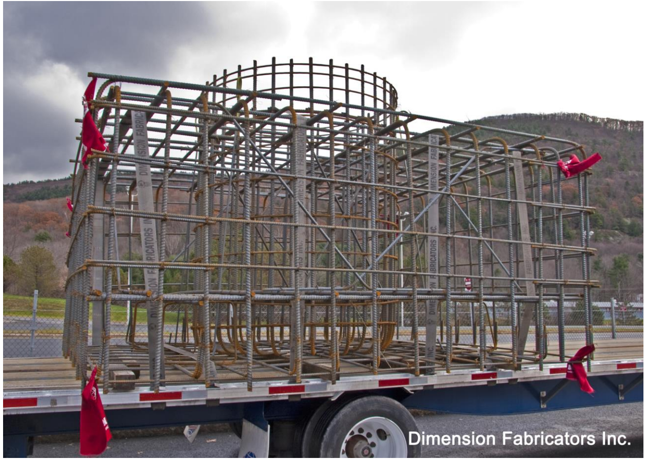
Dimension Fabricators Inc.