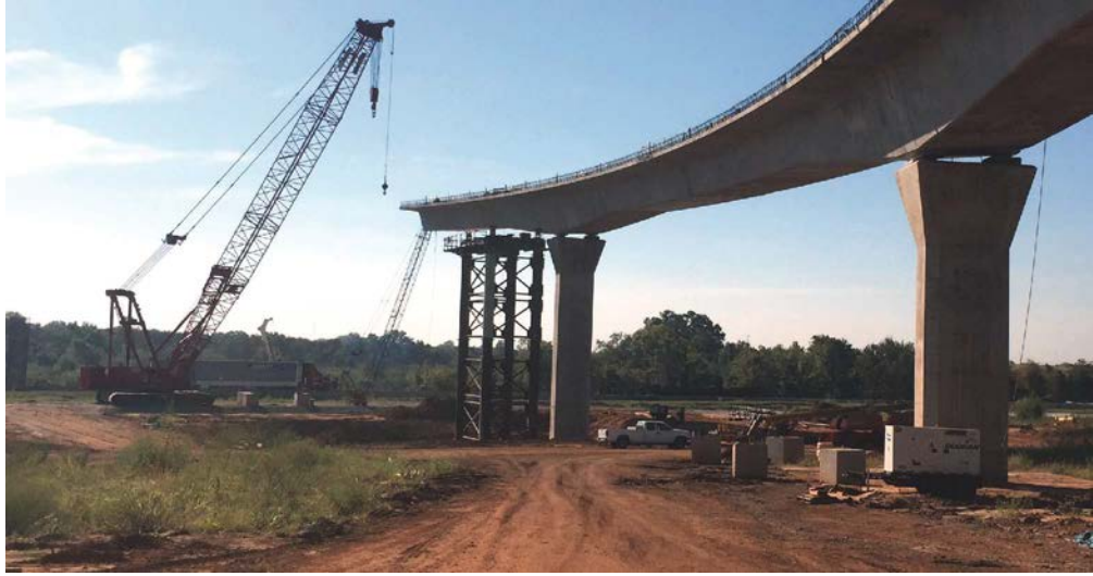
Each of the three segmental concrete box-girder ramps has a horizontal curve and a linear haunch over the piers to increase the segment depth and maximize the span lengths while providing an aesthetically pleasing appearance.

Jerry Pfunter is a principal with FINLEY Engineering Group in Tallahassee, Fla.