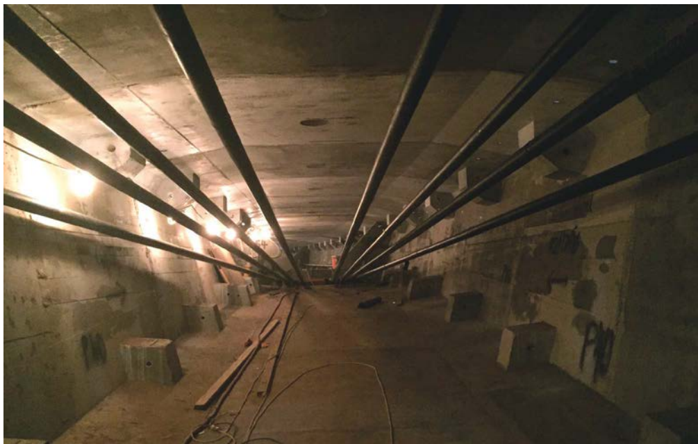
External continuity tendons within the box-girder core. The same box-girder core was used for all three of the interchange's segmental concrete ramps.