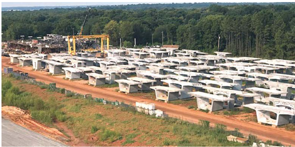
Precast concrete box-girder segments were fabricated and stored at the project site. This view of ramp EN segments was taken from ramp SE. The segment fabrication plant is at the far left of photo.