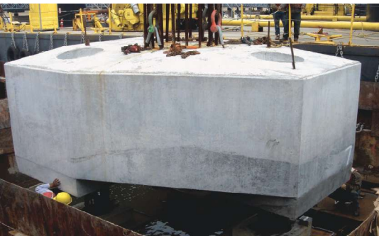
Precast concrete pile cap on Escambia Bay Interstate 10 design-build project.

Increasingly, FDOT realized that the design-build format meant it didn't need to have all the solutions to transportation problems. FDOT quickly witnessed the power of mobilizing hundreds of minds to focus on developing the best comprehensive solution to a complex transportation problem through a competitive process.