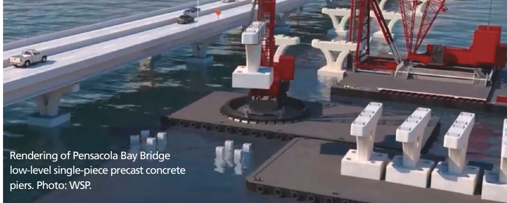
Rendering of Pensacola Bay Bridge low-level single-piece precast concrete piers.

through the ATC process that its ATC solution (interchange reconfiguration, for example) is equal to or better than the RFP requirements.