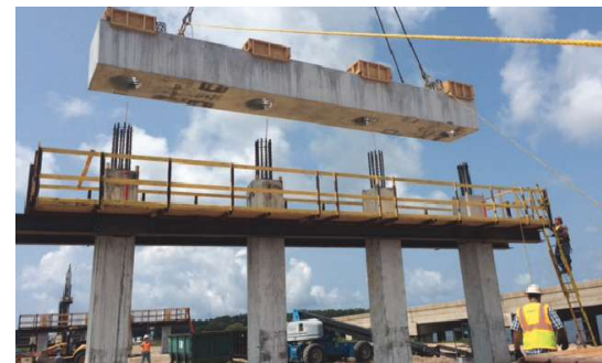
Precast concrete bent cap being erected on SR 83 (US 331) over Choctawhatchee Bay.

It is important for the RFP to be customized to provide an appropriate breakdown in technical score points to achieve an acceptable outcome. What is important on an urban interchange project in south Florida may be quite different from a rural project in north Florida.