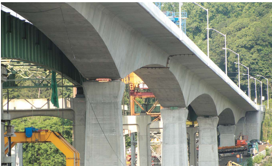
STV provided construction inspection services on the Roslyn Viaduct project on New York Route 25A over Hempstead Harbor in Nassau County, N.Y. The bridge was replaced with a design featuring precast concrete haunched box girders that reflects the character of the original structure.