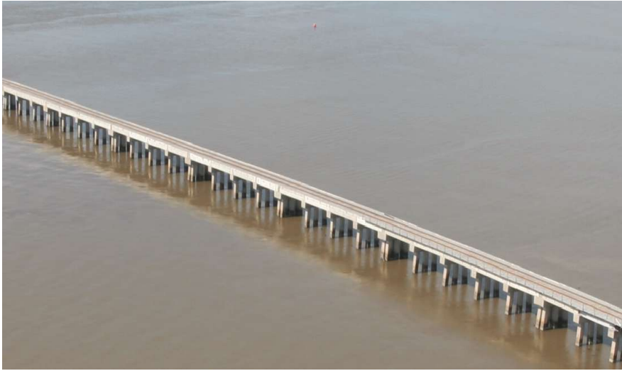
Speed was the critical component in STV's design for the CSX Transportation railroad bridge in Bay St. Louis, Miss., which was destroyed by Hurricane Katrina in 2005.