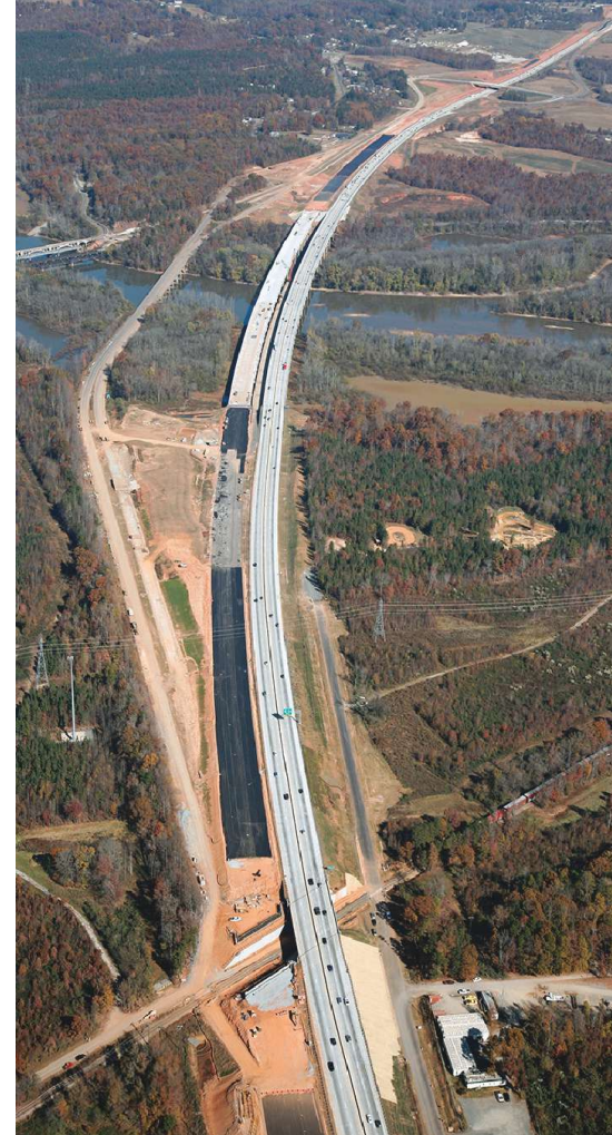
The I-85 Yadkin River Veterans Memorial Bridge was built on a site with multiple environmental constraints, severely limiting access from the north, west, and east.

Span lengths also will increase, he says. "We're definitely looking to concrete for longer spans. We're