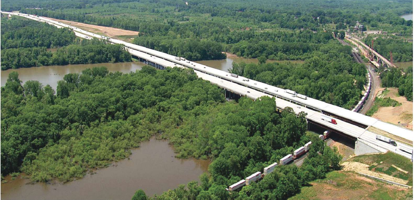
The I-85 Yadkin River Veterans Memorial Bridge near Salisbury, N.C., featured dual 2900-ft-long structures.

force on ABC, which took a high-level approach to the concept. “Our goal was to streamline environmental permitting and allow construction to begin quicker and be more efficient,” he says. “Permitting is a key part of the scheduling process.”