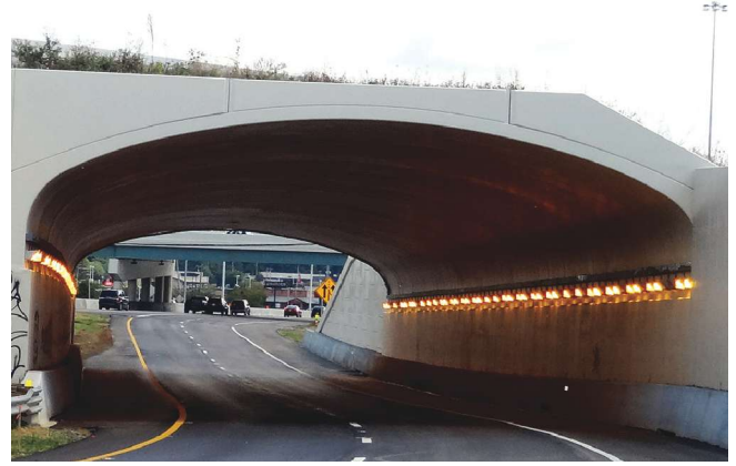
View of completed tunnel looking east, with computer-controlled lighting system.

Long-term durability of a structure is always a goal of the client and the designer. To improve durability, the Ohio Department of Transportation requires the use of epoxy-coated reinforcement in all precast concrete three-sided culverts, as well as in all cast-in-place concrete. To further enhance the durability of the structure, a rubberized asphalt peel-and-stick membrane was applied to the exterior surfaces on the top and sides of the precast concrete sections after they were placed. On the interior faces, an epoxy-urethane sealer was applied to both the precast and cast-in-place concrete surfaces to protect