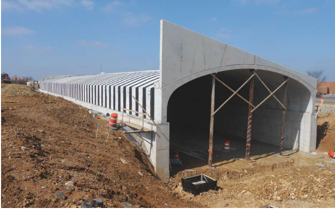
East end of tunnel during construction. Note precast concrete headwall and temporary supports below precast concrete end section.