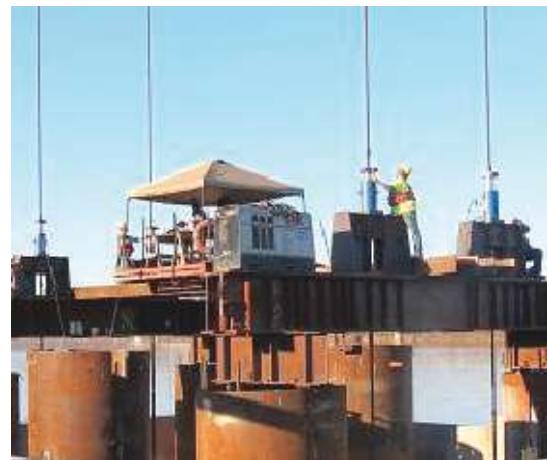
Lowering of the precast concrete coffercells.