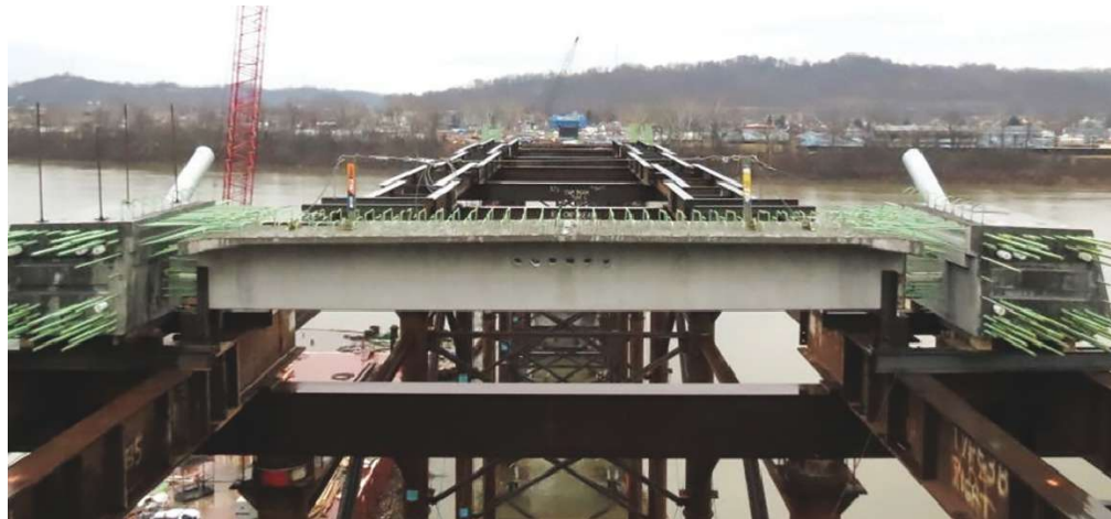
Precast concrete floor beams and stay-in-place deck forms saved $250,000 through value engineering change proposals.

Construction of submerged footings for the pylons within the Ohio River was a challenging task. The use of a precast concrete coffercell was one of the innovations that minimized complications, increased safety, and reduced construction time.