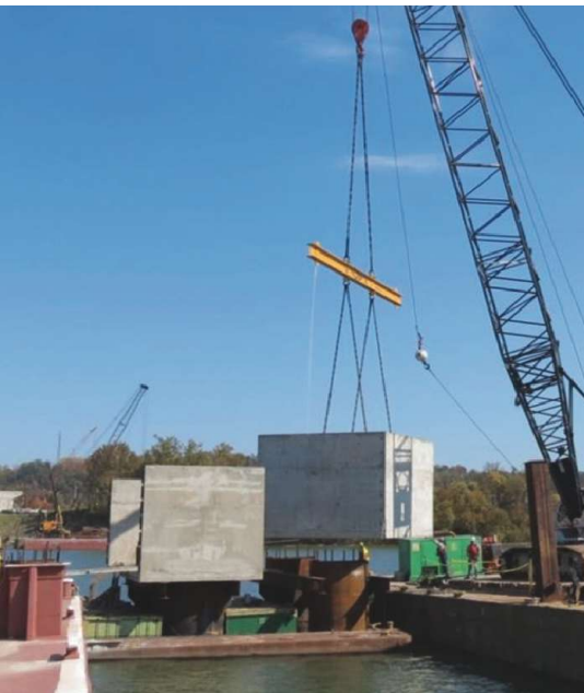
Precast concrete coffercells being lowered into place.

Constructing the back spans on falsework simplified construction, reduced construction time, increased project safety, and reduced the amount and size of the equipment required for the pylon and main span construction on the