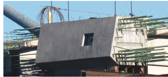
Design innovation – precast concrete anchor blocks.