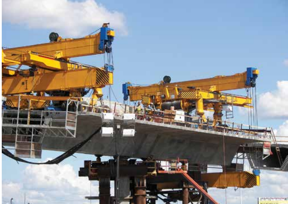
Segment lifters work in tandem during balanced cantilever construction.

The manufactured precast concrete segments were trucked to the project site and hoisted into place by large cranes or two segment lifters that were employed for the balanced cantilever