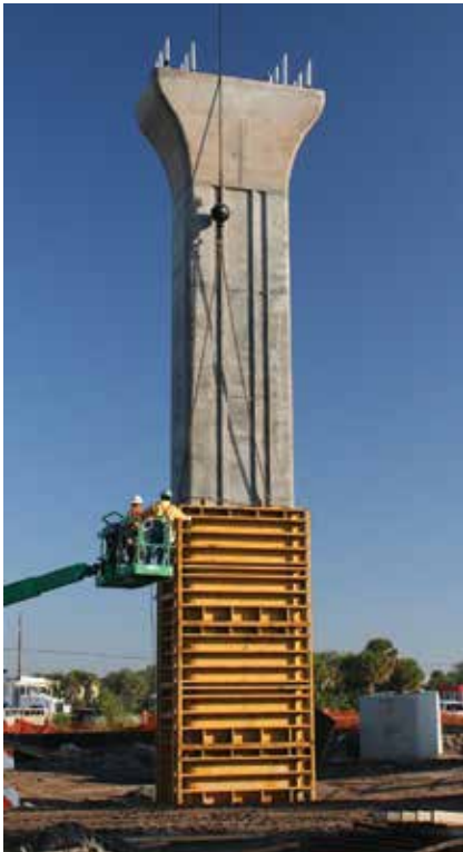
One of the project's many columns constructed using "bottom-up" concrete placement.

The project involves 35 bridge structures. Florida bulb-tees with a cast-in-place concrete decks are used for most of the tangent portions. Precast concrete segmental construction—utilizing both balanced cantilever and span-by-span construction methods—tie into the highways at either end. Other construction that is part of the project widens or rehabilitates existing bridges using Florida U-beams and Type IV AASHTO beams.