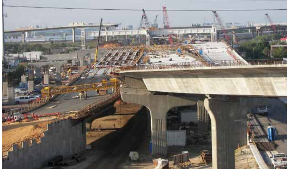
Segmental and bulb-tee bridges are seen in this photo looking south. It also shows mechanically stabilized earth wall construction, a concrete deck placement, and a look at the toll gantry across all lanes.

This highly complex project has faced numerous challenges throughout design