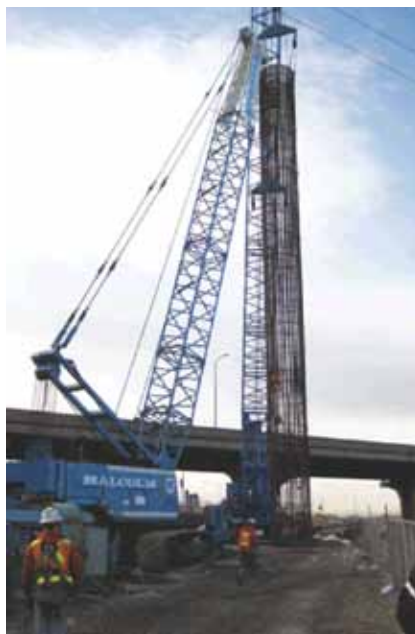
Column reinforcement cage in a 9-ft 2-in.-diameter drilled shaft.

The abutment is isolated from the approach embankment to reduce loading effects from the lateral spread of the embankment in an earthquake. The abutment embankment is protected through the use of deep-soil mixing.