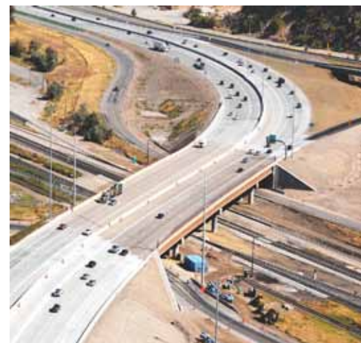
Completed twin bridges at Beck Street and I-15 (looking North-East).