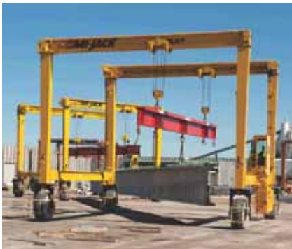
The girders are 7 ft 10½ in. deep and are shown in the fabrication plant.