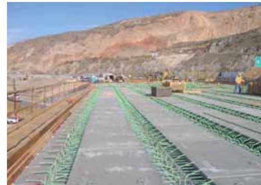
Precast concrete partial-depth deck panels provide a high-performance concrete, stay-in-place form and all of the positive moment reinforcement between beams in the bottom of the 8½-in.-thick composite deck.

For additional photographs or information on this or other projects, visit www.aspirebridge.org and open Current Issue.