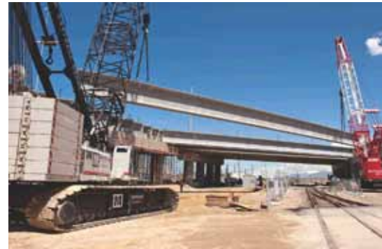
Each girder weighed up to 242 kips.

guide the girder designs. The girders required 8500 psi compressive strength concrete to reach the desired span length. The specified strength of the concrete at prestress transfer was 6500 psi. The girder bearings are 5¼-in.-thick reinforced elastomeric pads. The use of the long precast, prestressed concrete girders was vital in accelerating the schedule, minimizing impact to the railroads, and reducing costs.