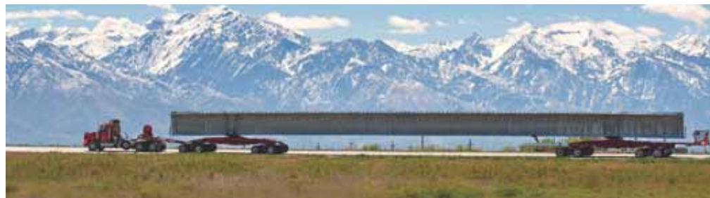
A precast, prestressed concrete bulb-tee girder during transport to the project. At 194 ft 5 in., the girders were the longest used in the United States at the time.

Keeping with UDOT's commitment to incorporating accelerated bridge construction elements during design,