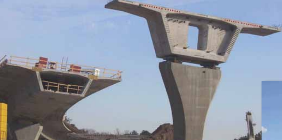
Below: Cantilevers are supported using temporary support frames to stabilize the structure and reduce the loads on the pier during segment erection.