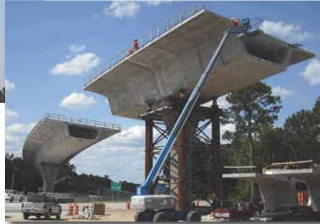
Above: Construction of the Pier 3 cantilever begins with placement of the pier table. Pier tables were constructed using split segments to reduce the lifting weight. The tapered lines of the column cap create an elegant shape with the slope of the segment webs.

of I-95, limited horizontal clearance prohibited the use of larger column sizes. To get the most cross-sectional area from the available space, the hexagonal columns offered an ideal shape as the bridge crossed this critical location at a skew.