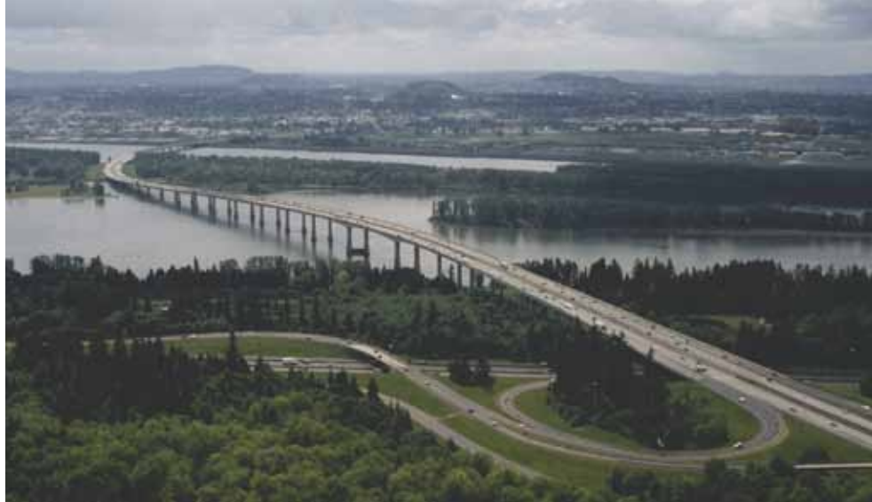
Seen from the north, the 1982 Glenn L. Jackson Memorial Bridge across the Columbia River at Portland was touted as the "first of a new generation of large segmental bridges."