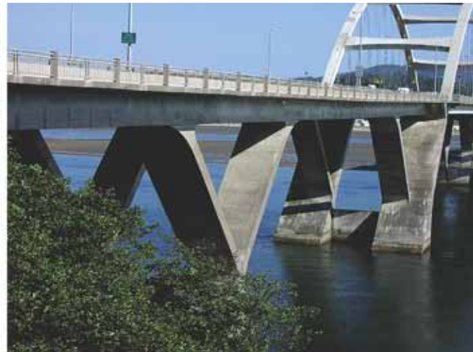
The 1936 Alesha Bay Bridge, shown on left, at Waldport was one of five bridges built simultaneously under a large Public Works Administration project that eliminated five ferries along the Oregon Coast Highway. Designed by Conde B. McCullough and his staff to complement their natural settings, all five bridges included reinforced concrete arches. The Alesha Bay Bridge was replaced in 1991 with a new bridge, shown on right, that features post-tensioned concrete box-girder approaches.