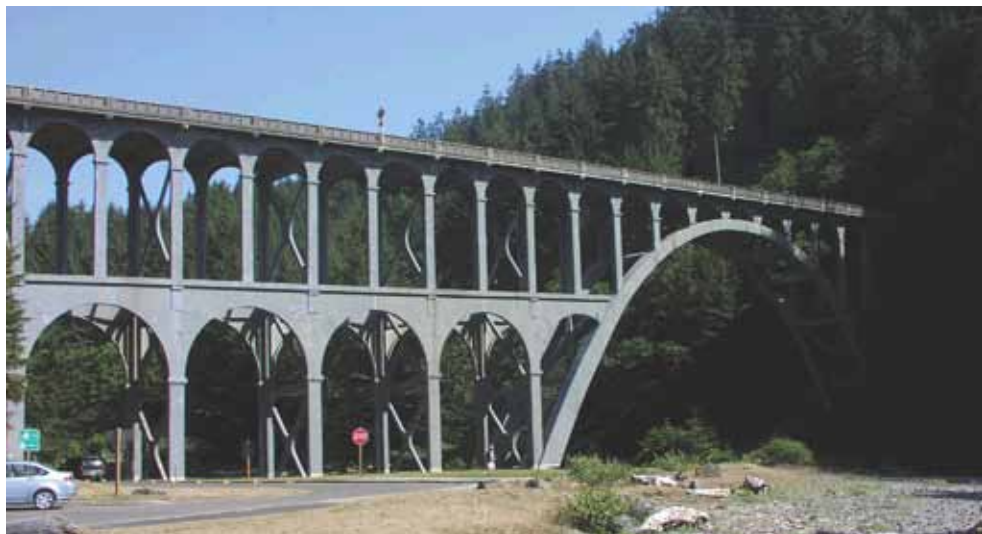
The Cape Creek Bridge on the Oregon Coast Highway is a 619-ft-long, two-tiered reinforced concrete arch inspired by the Roman aquaduct near Nimes, France. The bridge, completed in 1932, is still in use today.