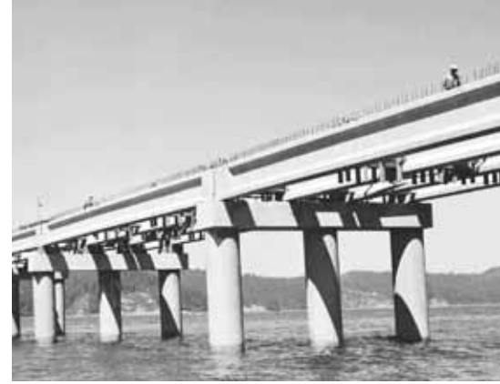
The 1966 Columbia River Bridge at Astoria includes a 2.1-mile-long section of 80-ft-span AASHO Type III precast, prestressed concrete girder construction in the shallow middle of the river, shown here during construction. The south approach of the bridge also includes a 1095-ft-long section of AASHO Type II and Type III precast, prestressed concrete girder construction. The bridge was built jointly by the states of Oregon and Washington.

In 1954, OSHD prestressed concrete beam designs were used to build Willow Creek Bridge with three 98-ft-long spans on the Columbia River Highway near Arlington and the 93-ft-long span Haines Road Undercrossing in Tigard. Using concrete compressive strengths of 5000 psi and prestressing strand of 7/16-in.-diameter prestressing strands with an ultimate tensile strength (UTS) of 200 ksi allowed considerably longer spans than with 40 ksi yield strength reinforcement. Also in 1954, a Bureau of Public Roads design for a 60-ft span precast concrete beam, post-tensioned before placement, was used to build Ten Mile Creek Bridge on the Oregon