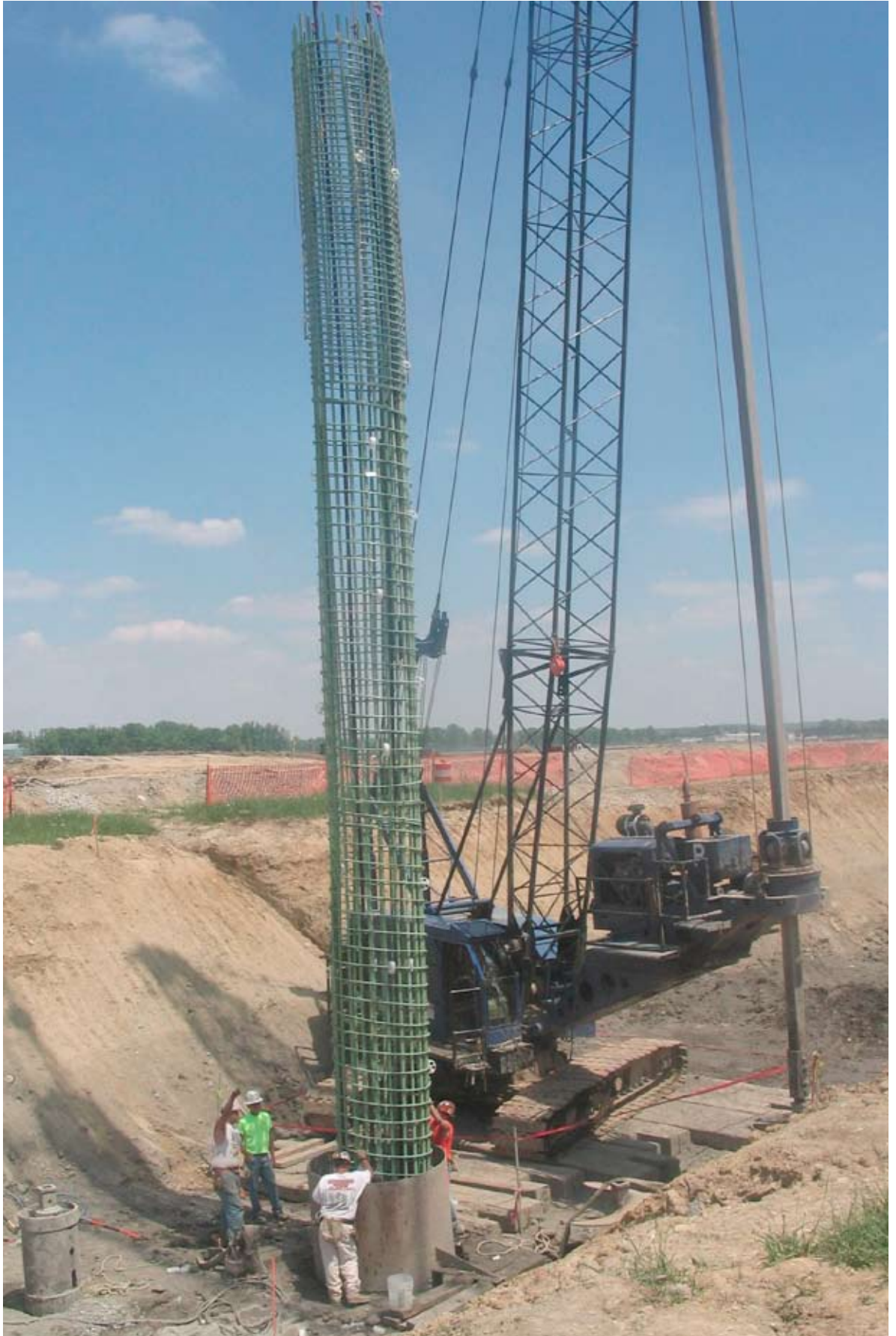
Drilling Shaft Installation.