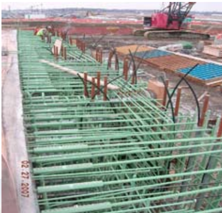
PT End Block.