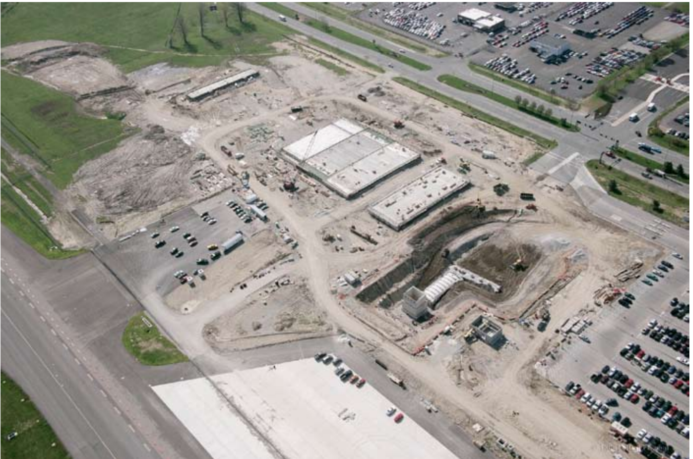
Aerial View During Construction.