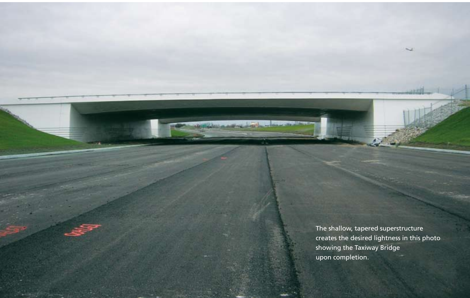
The shallow, tapered superstructure creates the desired lightness in this photo showing the Taxiway Bridge upon completion.

The goal was a slender structure with a large clear opening.