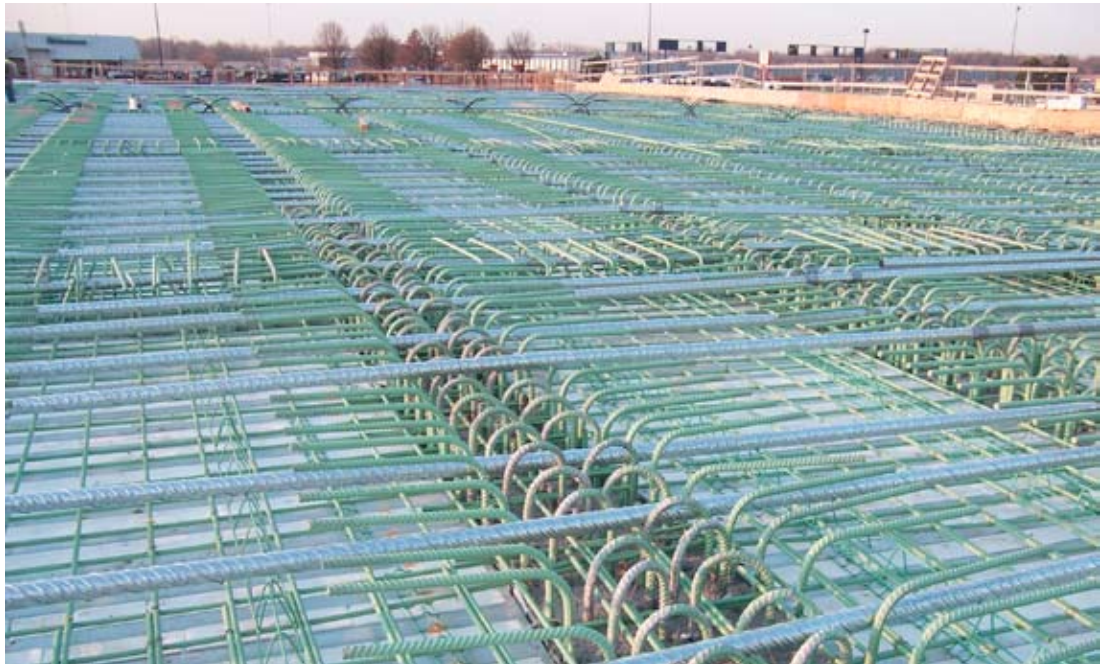
PT Duct Layout