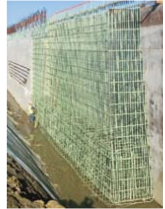
Illustration Inset (left)

The centerpiece of airport expansion structures is the Crossover Taxiway Bridge at the Port Columbus International Airport.