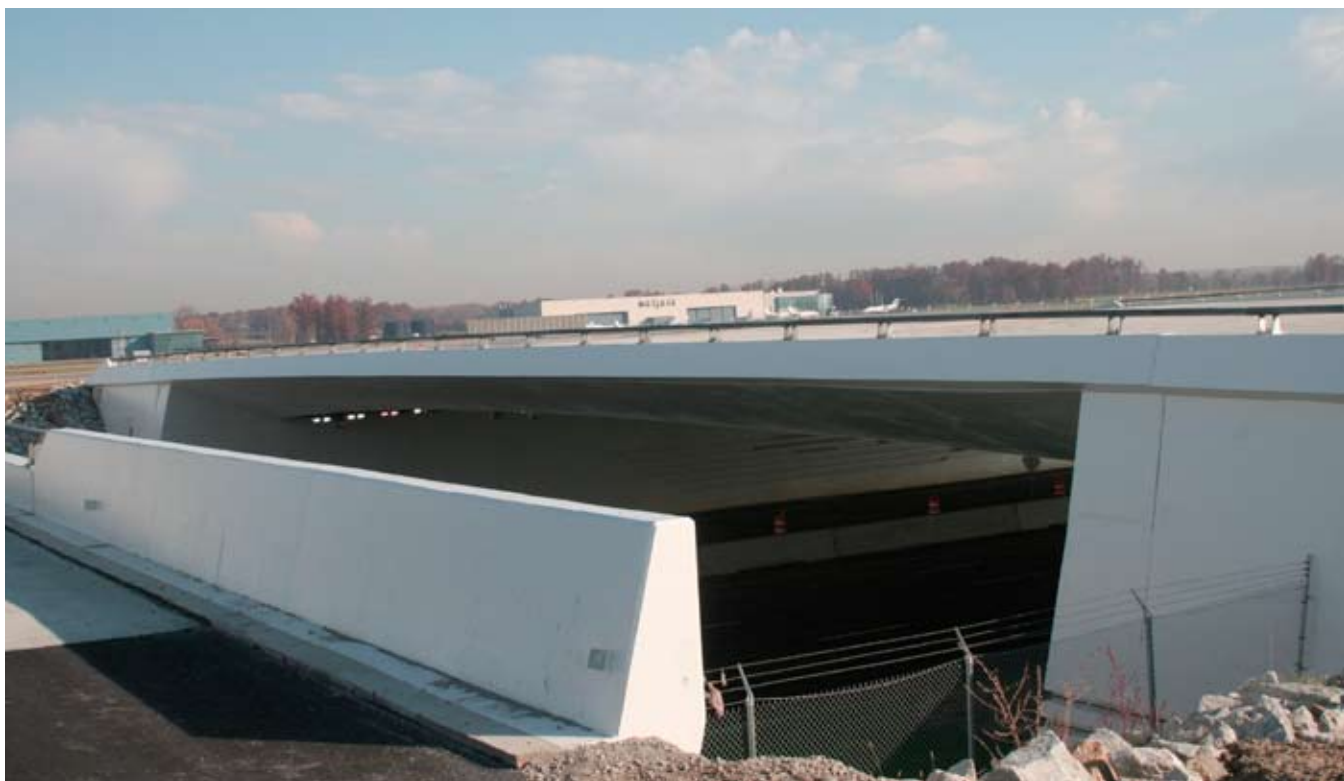
View from along Bridge.