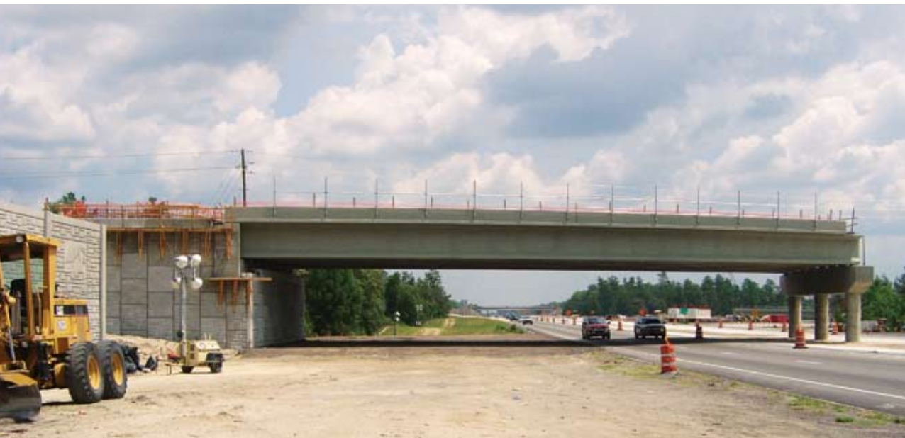
Completed section of Graves Avenue Bridge over I-4.

The conventional precast, prestressed concrete bridge consists of superstructures with pretensioned concrete beams and cast-in-place decks, a technology that has been used extensively in the United States since the 1950s. At the other extreme is an accelerated bridge construction technology that cuts on-site construction