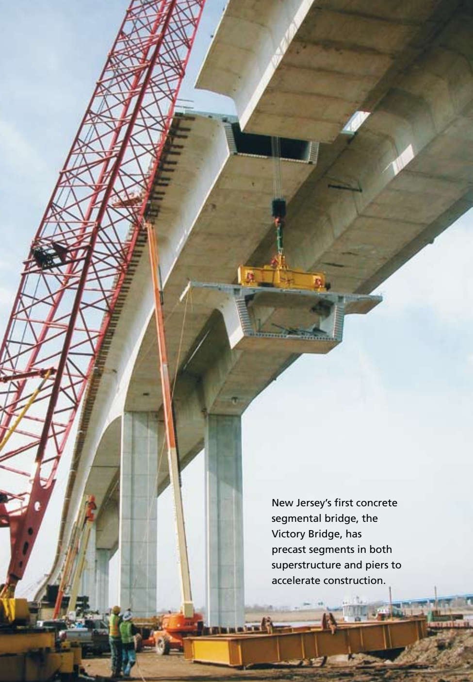
New Jersey's first concrete segmental bridge, the Victory Bridge, has precast segments in both superstructure and piers to accelerate construction.

bridge project, whether cast-in-place, reinforced concrete; cast-in-place, post-tensioned concrete; precast, reinforced concrete; precast, pretensioned concrete; or precast, post-tensioned concrete. Most bridge projects have components of more than one concrete bridge technology. The determination of the most appropriate technologies depends on project time requirements, site constraints, and availability of the technology and the related expertise. Examples of accelerated bridge construction projects in each concrete technology are described below. Both emergency replacement projects and planned rapid construction projects are included.