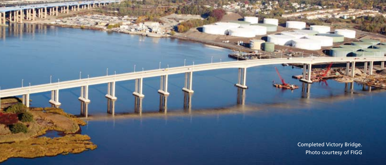
Completed Victory Bridge.

steel girders were then grouted, and the bridge was re-opened to traffic by early Monday morning.